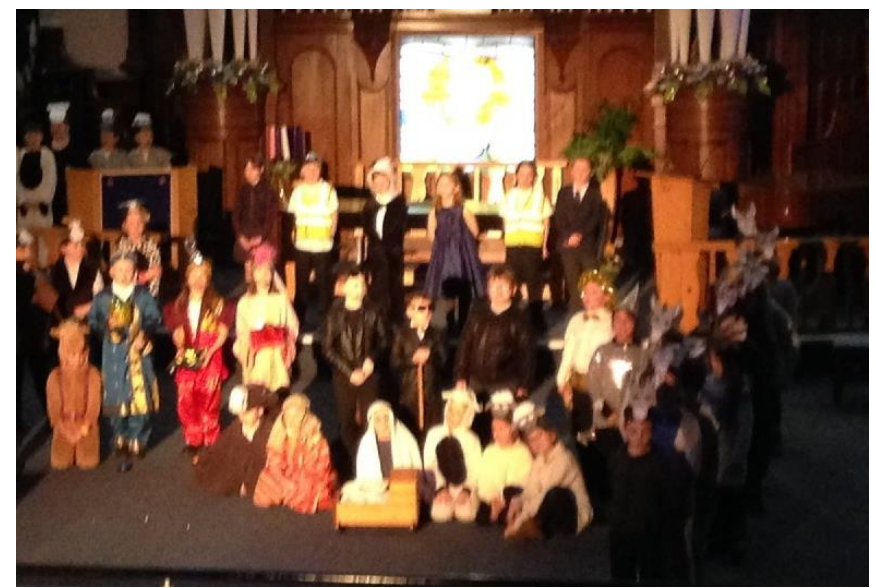
Year 4s Performed a Wonderful Nativity at Westborough Church

MONDAY 18 th December 2017 TO FRIDAY 22 nd December 2017 MENU: Week 1